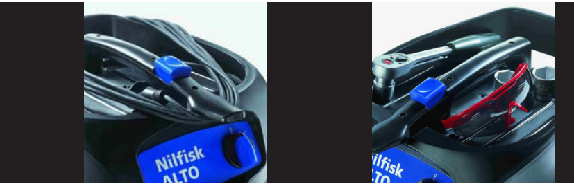
Ergonomic and sturdy grip for easy transport and cable storage.