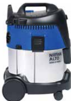
INOX models come standard with stainless steel collection container.