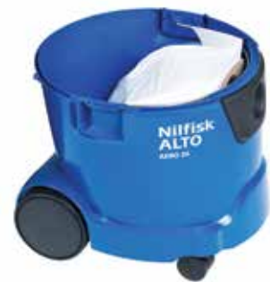
Fleece bags available for easy clean-up of debris.