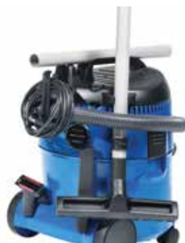
Accessory storage and tool deposit makes transport and storage easy and reliable.