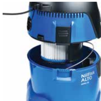
Long-lasting, washable PET filter retains to 1.0 micron.