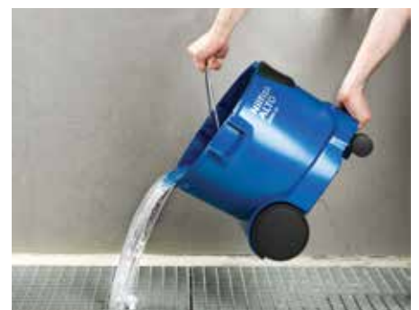
Integrated container handle makes disposal and lifting easy and convenient on AERO 21 and 26 models.