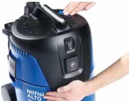
Push&Clean semi-automatic cleaning system, for quicker and easier maintenance.